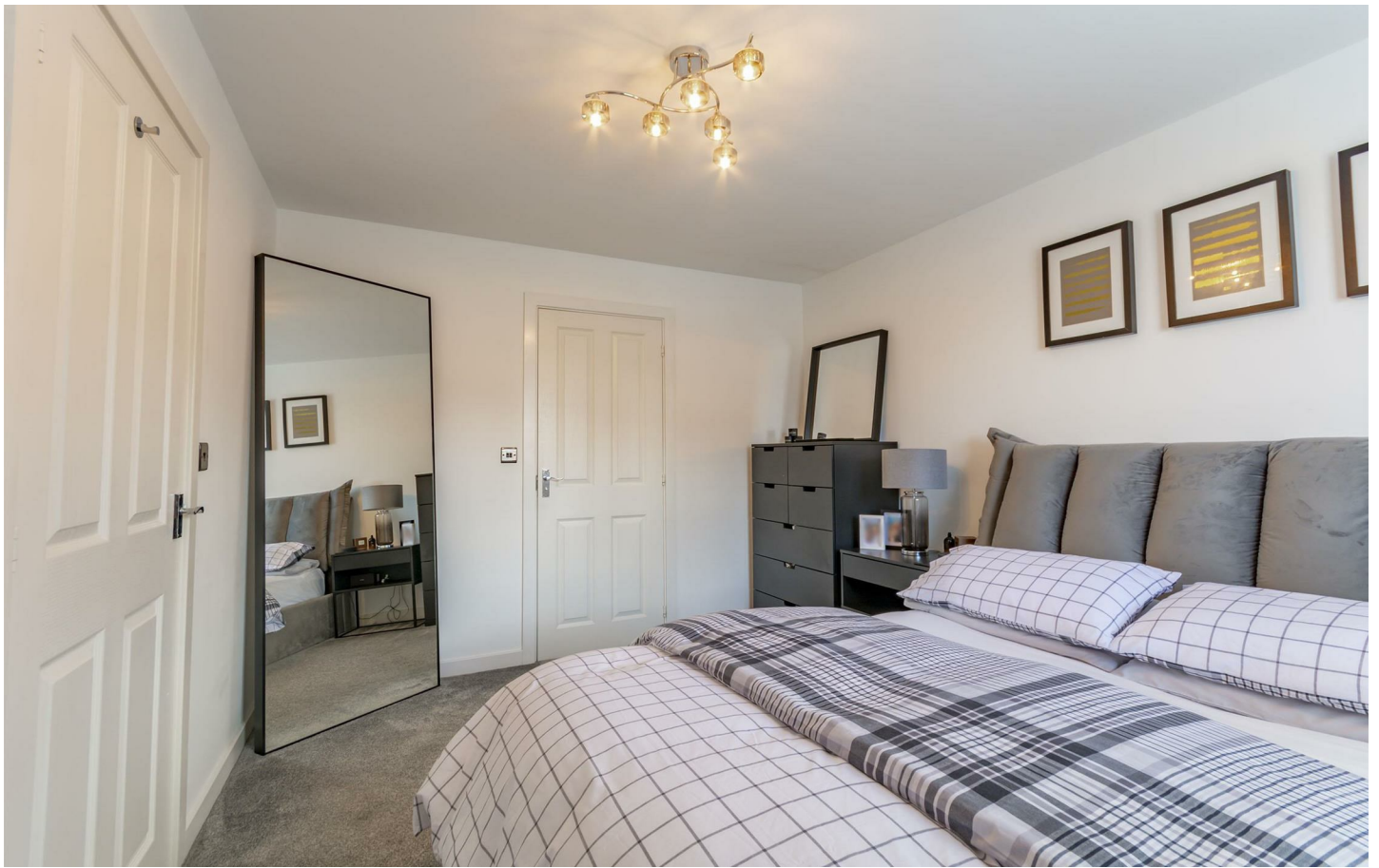
AN IMMACULATE TWO DOUBLE BEDROOM COACH HOUSE BEING SOLD WITH A GARAGE.

Robert Ellis are delighted to bring to the market a property that has been very well maintained by the current owner and is ready to move into. The property was built in 2010 and in the last few years the en-suite to the master bedroom has been upgraded and the kitchen has also been replaced for a very modern look with built-in appliances and a breakfast bar. The light and airy property is within walking distance of Long Eaton train station and comes with its own allocated parking and garage. A viewing is a must to fully appreciate everything this property has to offer.